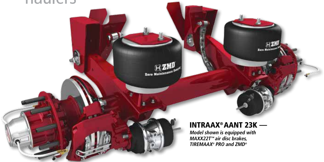
INTRAAX® AANT 23K — Model shown is equipped with MAXX22T™ air disc brakes, TIREMAAX® PRO and ZMD®